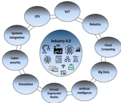
Fig.1: Main enabling technologies of Industry 4.0.

The integration of IoT sensors, artificial intelligence, machine learning, digital twins, and cloud computing is transforming conventional food processing into adaptive and predictive systems. Smart drying technologies, for instance, dynamically regulate temperature and airflow based on real-time moisture monitoring, thereby reducing energy consumption and preventing nutrient degradation. Predictive maintenance and automated control systems further enhance operational reliability and minimize downtime (Fig 1; Table 1). Through improved process optimization, loss reduction, and resource efficiency, Industry 4.0 technologies strengthen post-harvest management, support decentralized supervision of rural processing units, and enhance system resilience thereby contributing to the availability, stability, and efficiency dimensions of SDG-2.